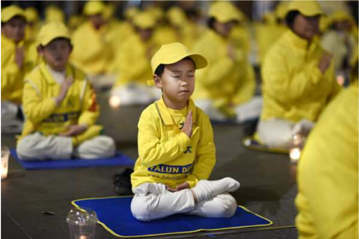
Falun Dafa practitioners commemorate lives lost and 20 years of persecution by the Chinese communist regime in Sydney, Australia, on July 19, 2019.