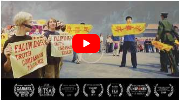
Why is Falun Gong Persecuted in China? Click here to Watch Now