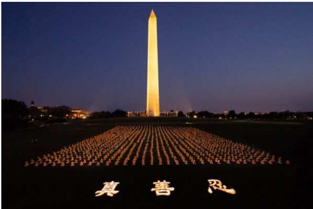
Falun Gong practitioners at candlelight vigil remembering victims of the 22 years of persecution in China at the Washington Monument on July 16, 2021. The characters for “Truthfulness, Compassion, Tolerance,” the principles taught by the spiritual practice appear at the front.

“One neighbor who used to be friendly swore at me and my family. Even children sometimes cursed at us because they too had been influenced by the propaganda,” he told Minghui, while recounting the persecution he suffered.