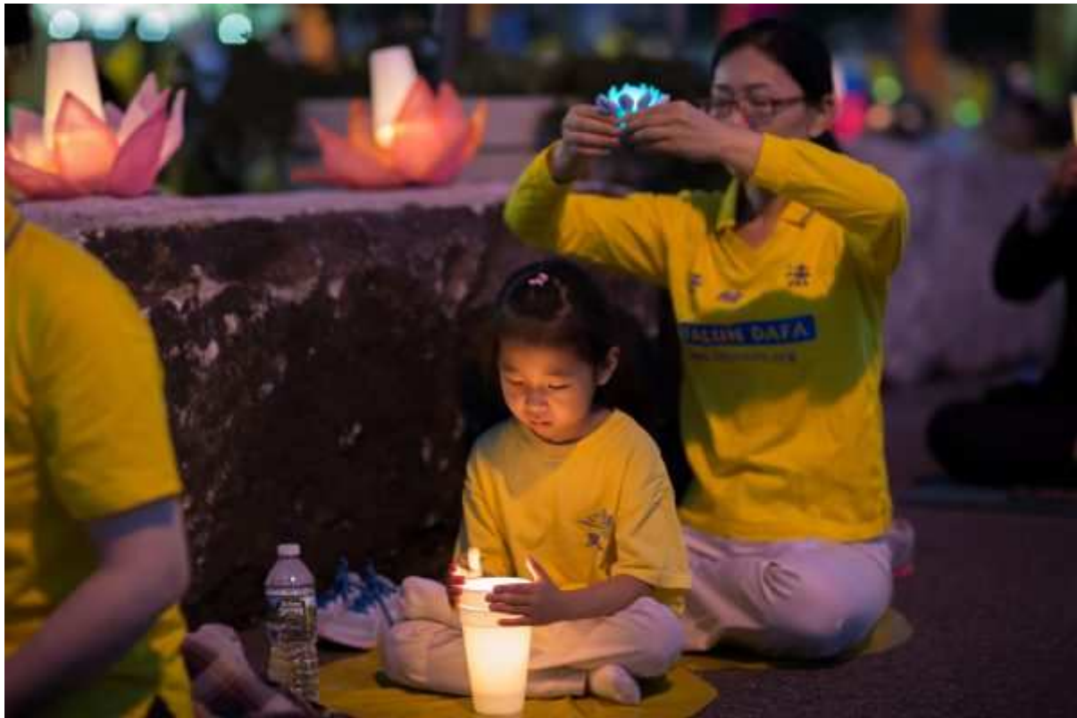
A mother and daughter join Falun Gong practitioners for a candlelight vigil in front of the Chinese Consulate in New York on July 16, 2017. Launched on July 20, 1999, the persecution is now entering its 18th year inside China.