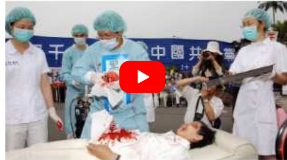
China's $$$-Billion Murder for Organs Industry Click here to Watch Now

END THE EVIL CCP (CHINESE COMMUNIST PARTY)